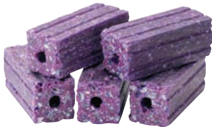
Photo is not representative of a label-consistent bait placement