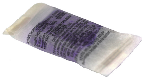
Photo may not be representative of a label-consistent bait placement